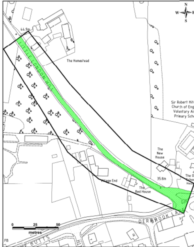
Little London Hill, Debenham